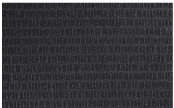
NATIVE-COSMOPOLITAN PARIS GZ DIS. SEERSUCKER