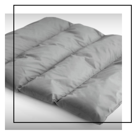
Ecodown® Fibers Light

On the opposite side of the spectrum, Thermore is launching the innovative Ecodown® Fibers Light, which delivers an extremely soft, yet ultra light free fiber insulation that is 20% warmer than comparable products. Ecodown® Fibers Light is also highly packable, which makes it ideal for people on the go.