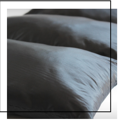
Ecodown® Fibers 2.0

The new expanded offer now includes the revolutionary Ecodown® Fibers 2.0, a super puffy blown fiber product suitable for wider baffle widths (up to 20cm). It offers amazing loft and visuals that are unmatched in the industry- still Thermore's proprietary technology regulates the warmth and avoids over-heating, thus keeping users comfortable.