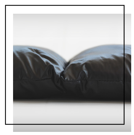
Ecodown® Fibers 2.0