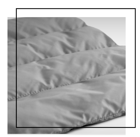
Ecodown® Fibers Light